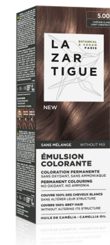
5.00 Light Chestnut